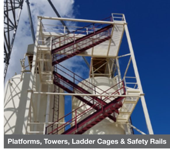
Platforms, Towers, Ladder Cages & Safety Rails