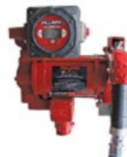
Fill Rite 319 VL Pump/Digital Meter

115/230V AC / 3/4 HP 114 LPM / 35 GPM FR 901 meter Filter 20' of 1" Arctic Hose Automatic Nozzle Recommended For: 4,600L - 10,000L