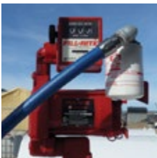
Fill Rite 701VL Pump/Meter

115V AC / 1/3 HP 76 LPM / 20 GPM FR 807 meter Filter 20' of 3/4" Arctic Hose Automatic Nozzle Recommended For: 2,300L - 4,600L