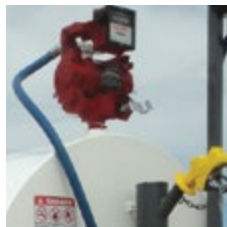
Fill Rite 311VL Pump/Meter

115V AC / 1/3 HP 76 LPM / 20 GPM FR 807 meter Filter 20' of 3/4" Arctic Hose Automatic Nozzle Recommended For: 2,300L - 4,600L