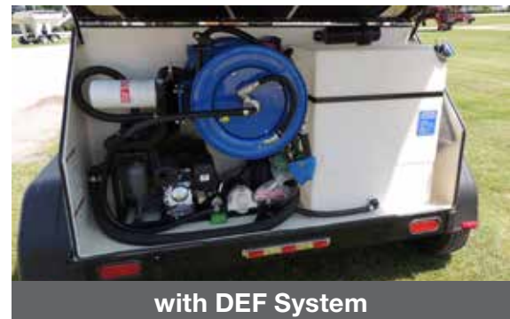
with DEF System

Refuel at your convenience using a Meridian fuel trailer. Our all-in-one trailers are equipped with a 6.5 hp gas engine and fuel pump that will get you back in the field faster than ever before!