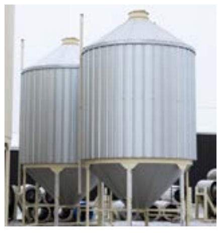
Shown with available insulated cladding.